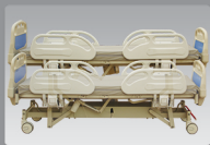
Height Adjustment: 18.5" - 33.5"