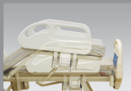
Leg Section Raise : 0 - 43 deg