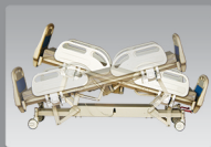
Tilt angles: Head Down = 25 deg Foot Down = 17 deg