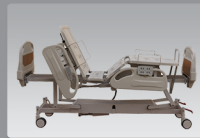
All major parts made of ABS Plastic for easy cleaning and maintenance