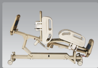
Cardiac Chair Position