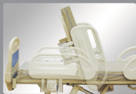
Head Raise : 0 - 70 deg