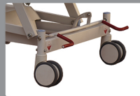
Central Locking Dual Castors for easy movement and maneuverability of the bed.